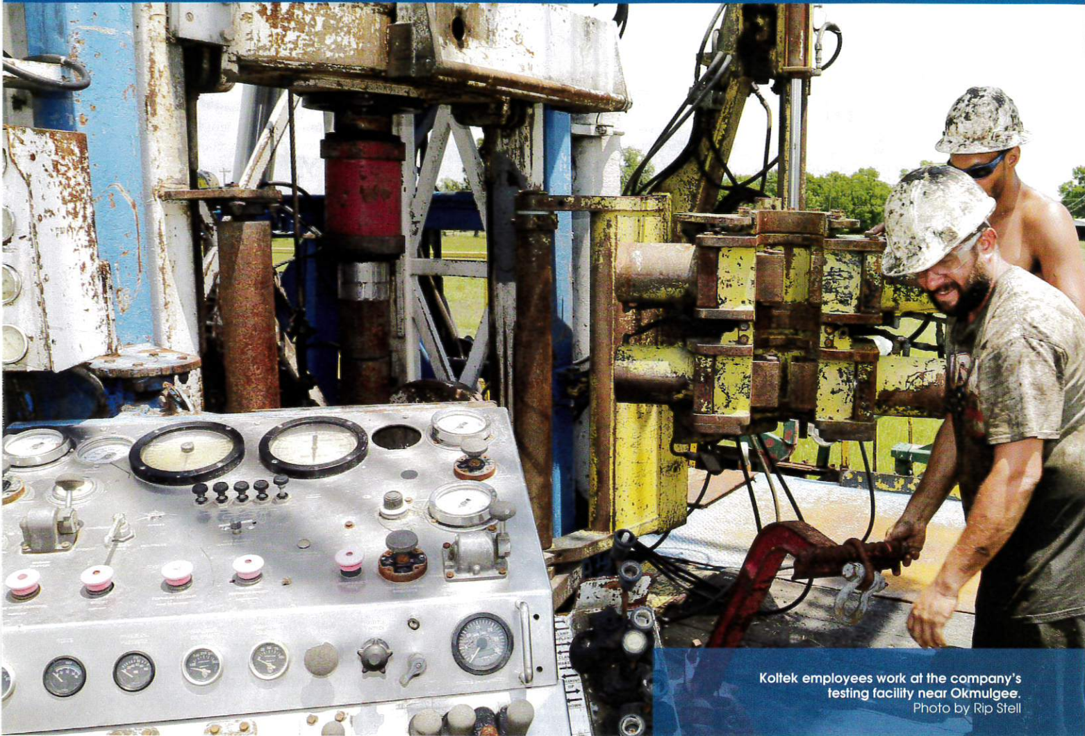
Koltek employees work at the company's testing facility near Okmulgee.